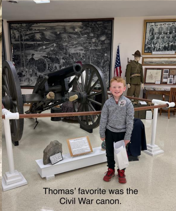
Thomas' favorite was the Civil War canon.